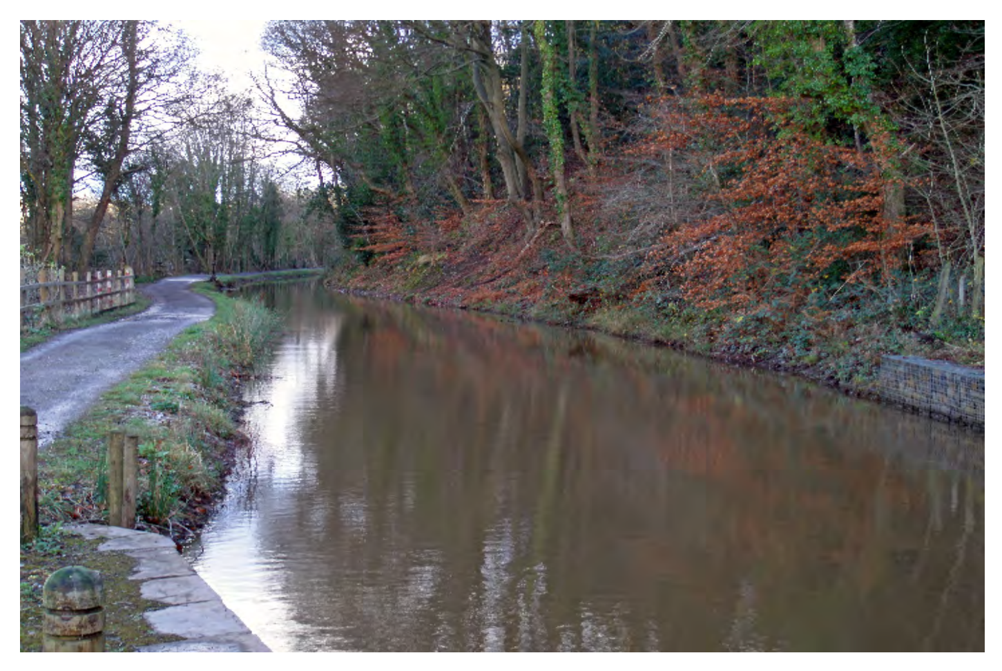
The stretch up-stream of Tyn-yr-heol Lock - now in water