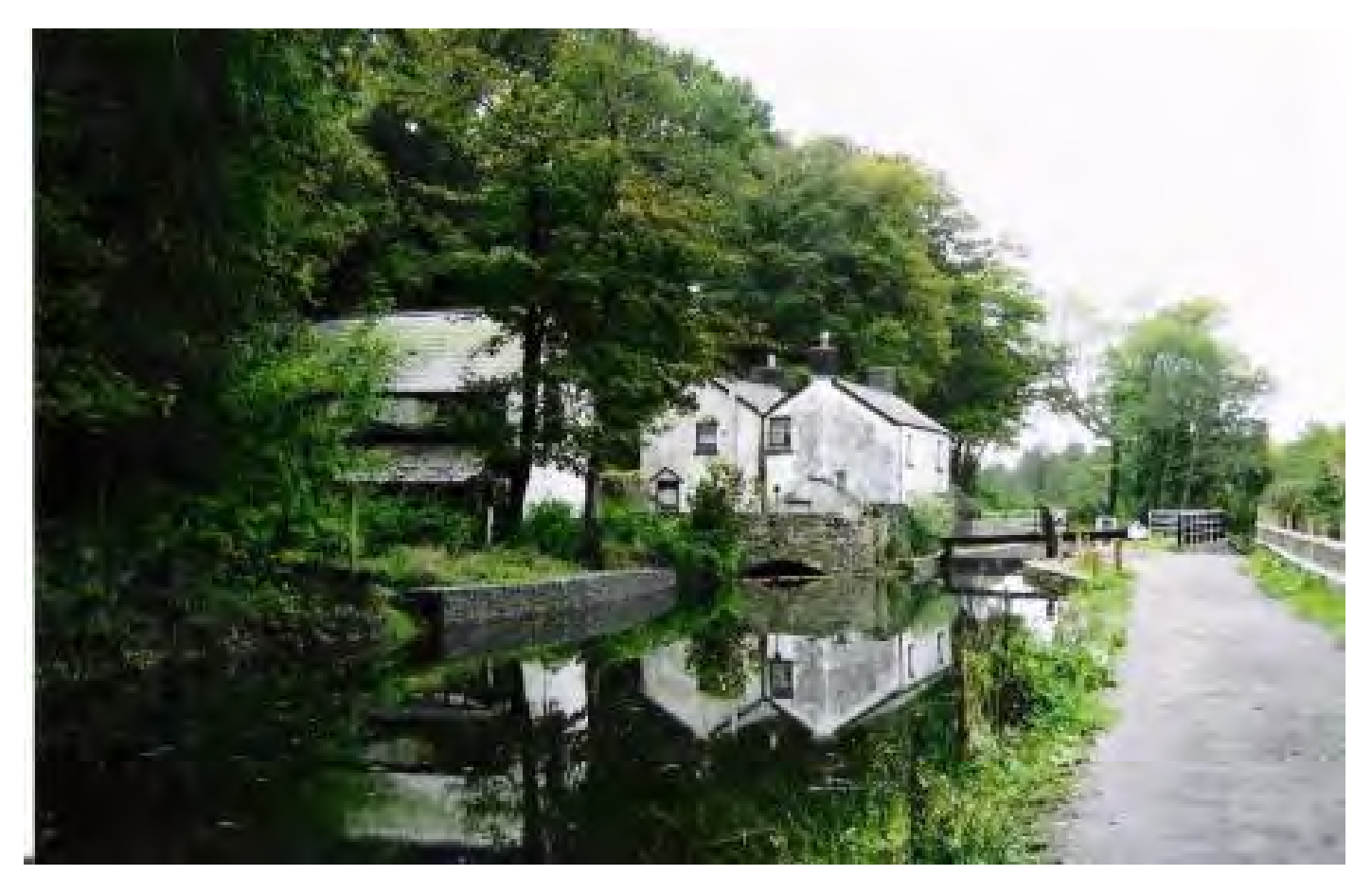
Tyn-yr-heol Lock, Tonna - looking towards Neath