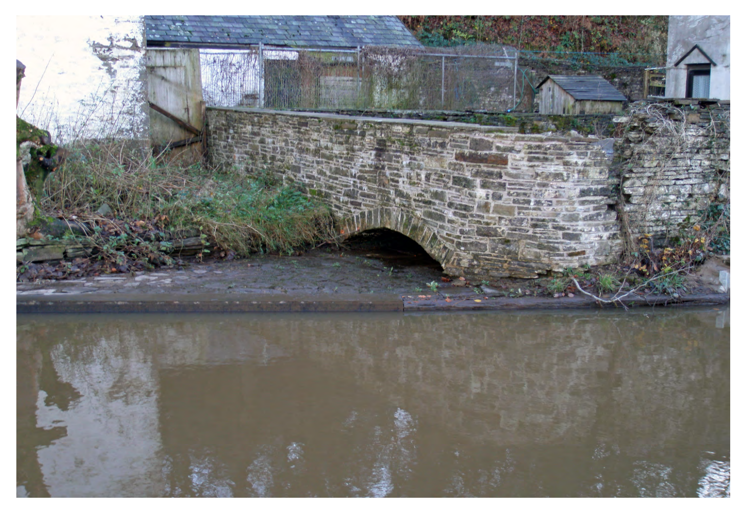
The new refurbished by-pass weir at Tyn-yr-heol Lock

A number of work parties have taken place lately - mainly clearing the Tonna Workshop site, which Was used by the contractord restoring Tyn-yr-heol Lock. For details of work parties please contact Malcolm Smith - Work Party Co-ordinator