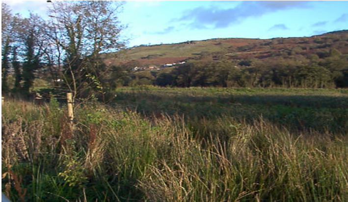
Reed Beds in action at Ynysarwed