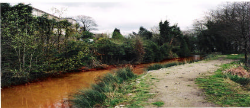
Pollution at Ynysarwed

The iron ochre sludge is currently taken to specialised landfill sites, whilst The Coal Authority's search for a better use of the iron ochre sludge continues