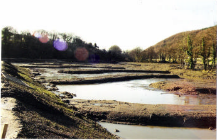
Reed Beds under construction at Ynysarwed