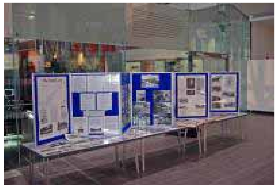
The Trust's Exhibit at the Glamorgan Family History Event which was held at the National Waterfront Museum, Swansea last November.