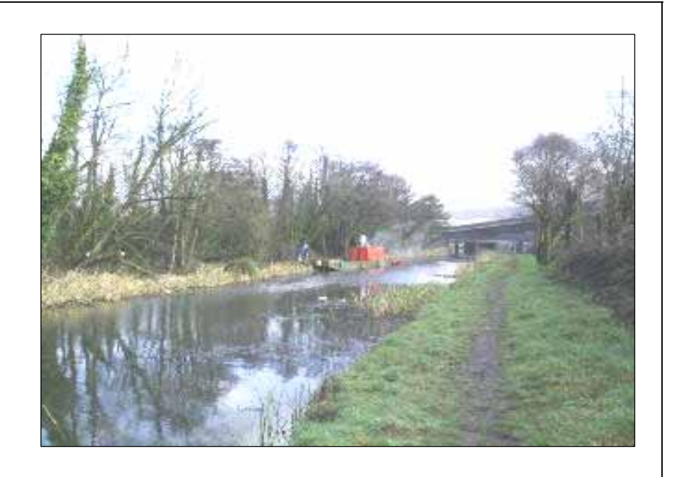
Tennant Canal near Neath Abbey – February 2008.