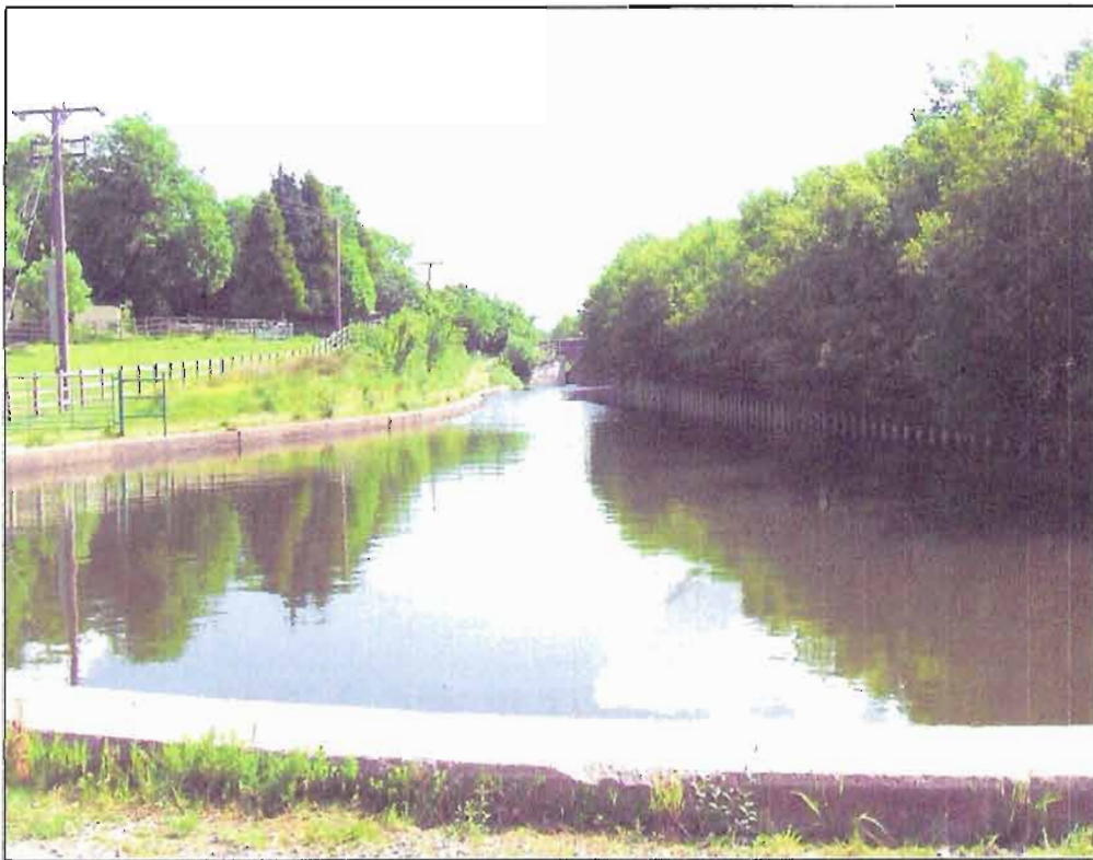
The Neath Canal looking north – the A465 subway is to the left.