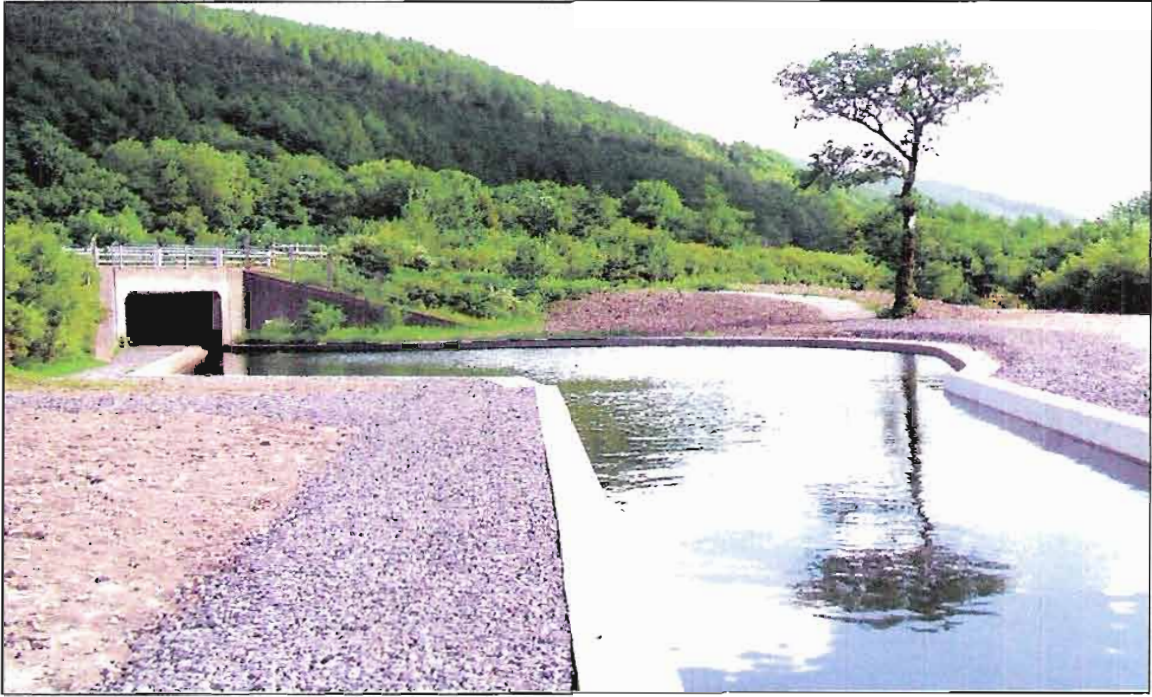
Two views of Ynysbwlllog Aqueduct – June 2008.