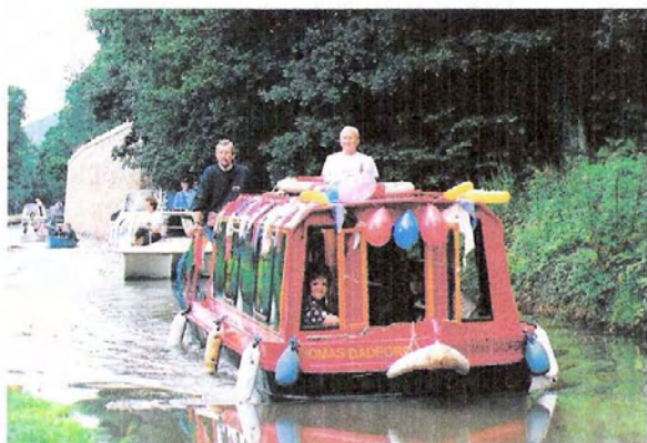
Boat Rally – Resolven – July 1991.