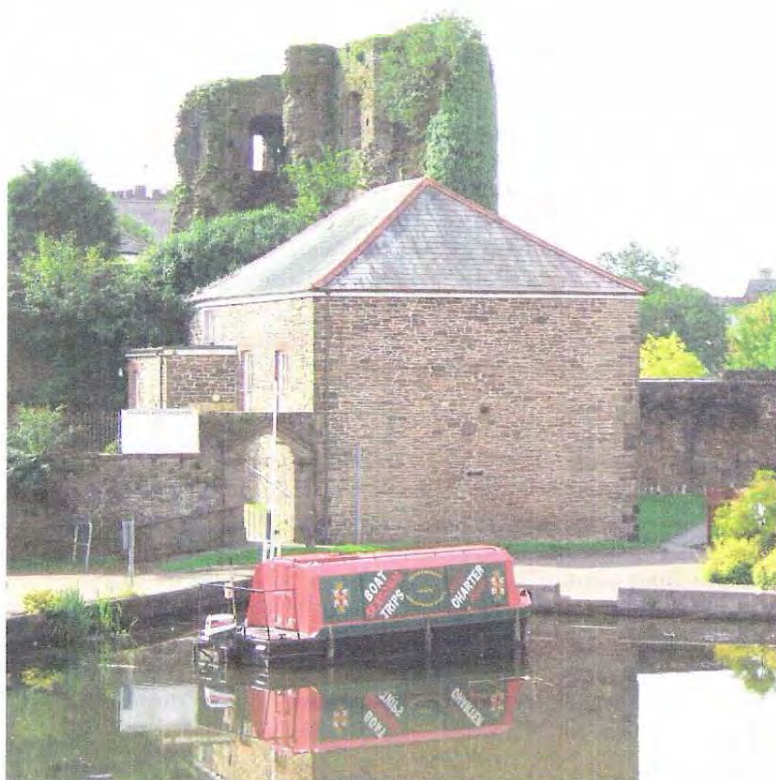
'Thomas Dadford' on a quiet September morning.