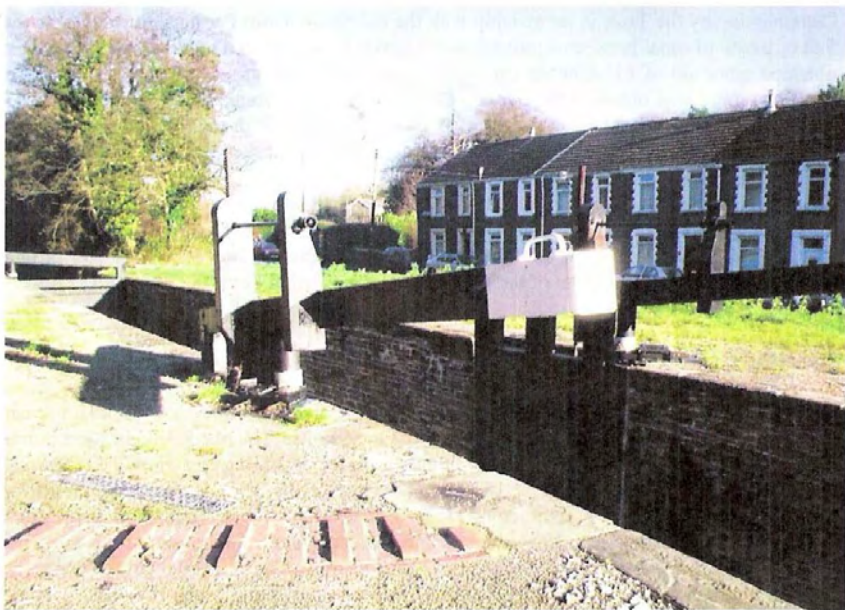
Newly restored lock at Clyne on the Neath Canal.

Work has already started on these two schemes and will be completed before 31 st , March 2006.