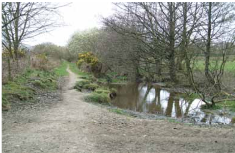
The Rhyddings Canal near Gilfach Road, Rhyddings, Neath.

If any members have any further information regarding this canal, please contact the Editor (Contact details on back page)