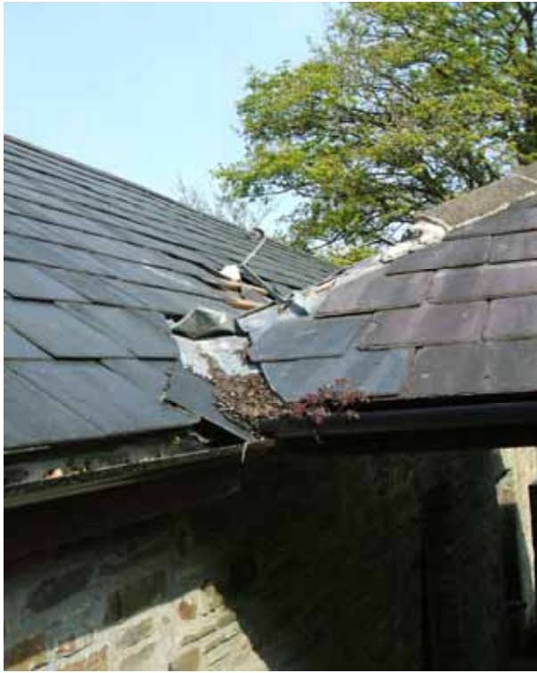
April 2009. Damage to the roof of the Workshops at Tonna. Slates were removed to get at the lead