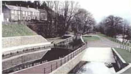
Owner: Neath Canal Restoration Co. Entrant: Neath Port Talbot District Council

The upper section from Resolven to Ysgwrfa was completed in 1990 and received a Civic Trust Award in 1993. The £4 million project was jointly funded by the Welsh Office and the Prince of Wales Trust. This project demonstrates the value to a community of restoring part of the former industrial infrastructure of the region so that it can be used as an important new leisure facility. This impressive work is truly restorative in that no new components have been added or invented.