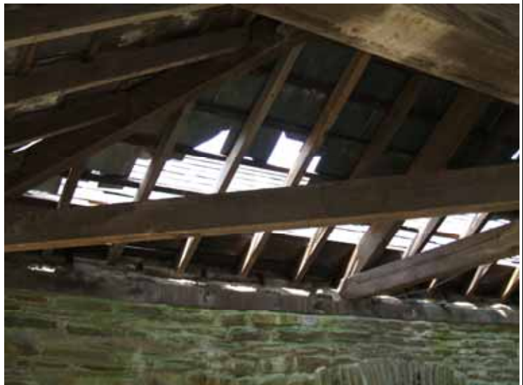
Looking up from the covered work area