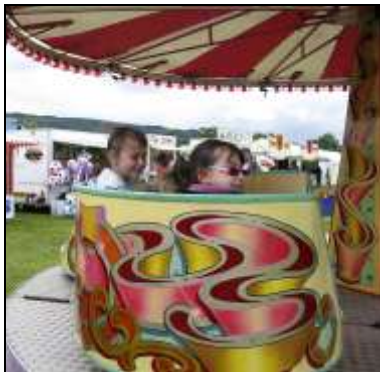
All the fun of the fair!

More photos on the Wilderness Boat Club website – www.wilderness.org.uk