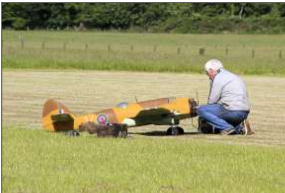
Model Aeroplane Display.