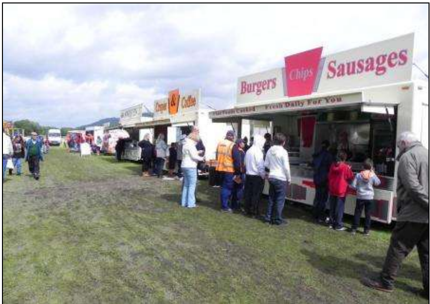
Keeping the visitors fed.