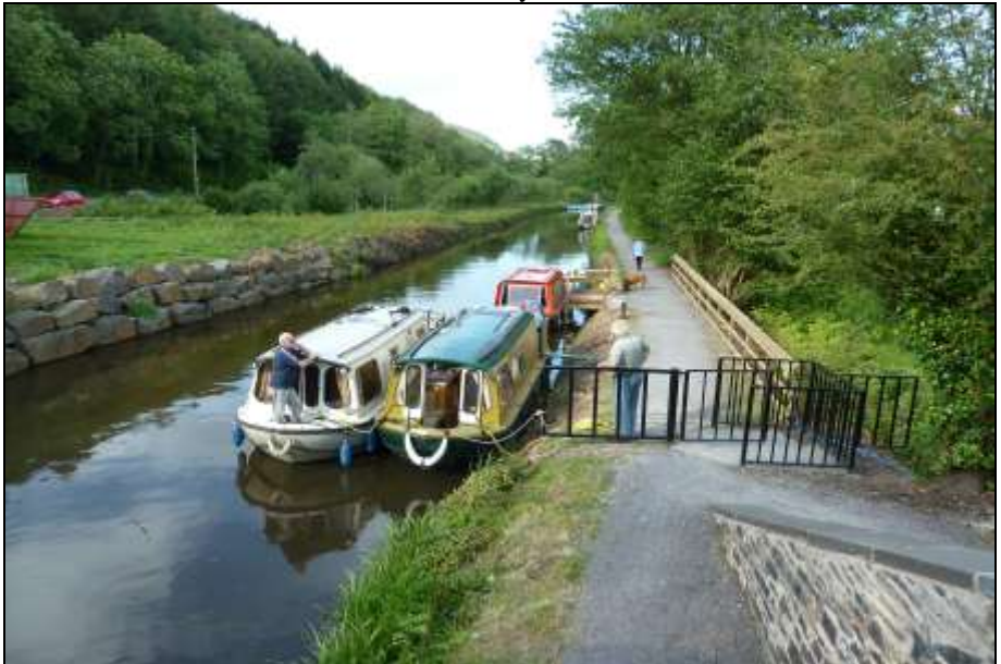
Boats start to arrive at the Festival Site.