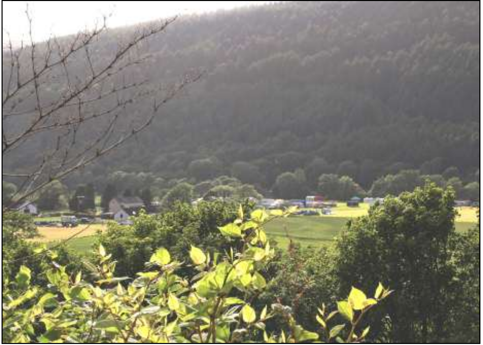
Two views of the Festival Site.