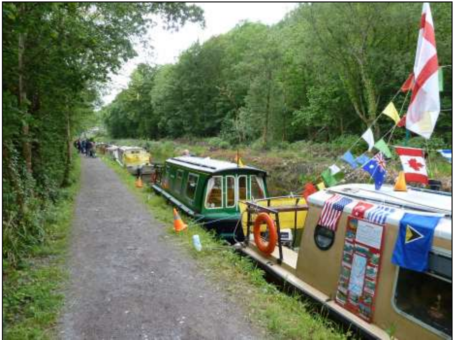
Welsh Waterways Festival – May 2011 – Some of the visiting trail-boats alongside the Festival site at Ynysarwed Farm.