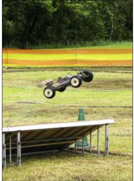
Model car racing.