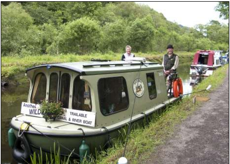
One of the Wilderness Boats.