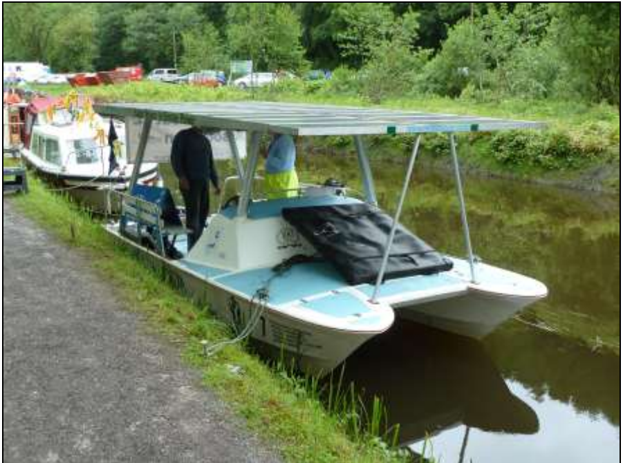
A Solar Powered Boat.