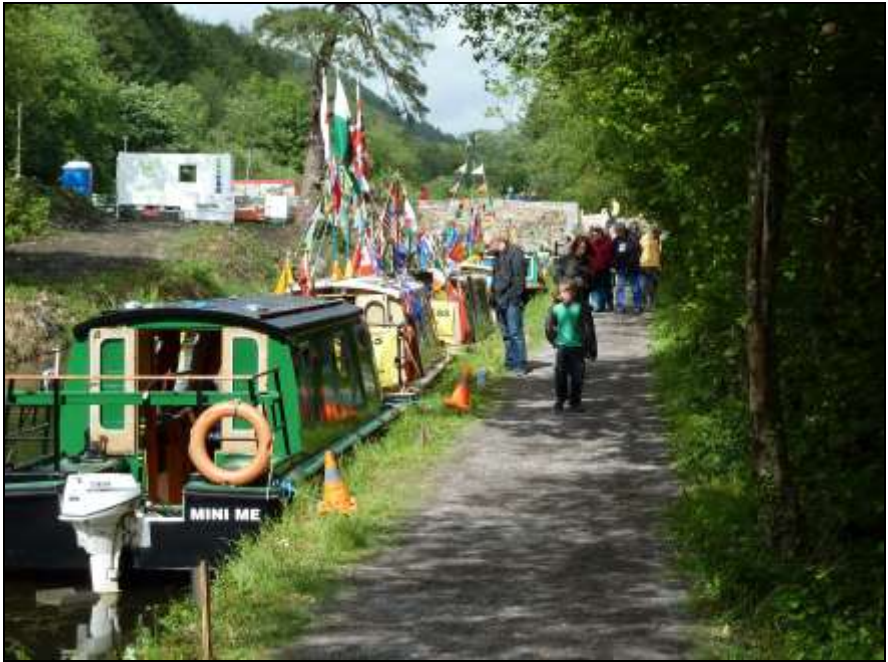
A busy scene on the towpath on the Saturday – when the sun eventually came out.