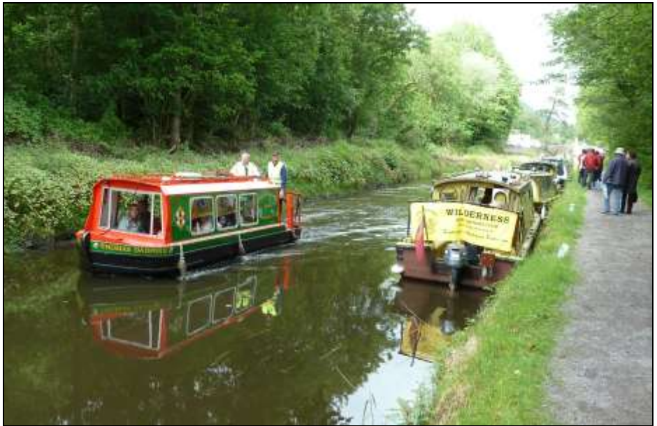
A full 'Thomas Dadford'.