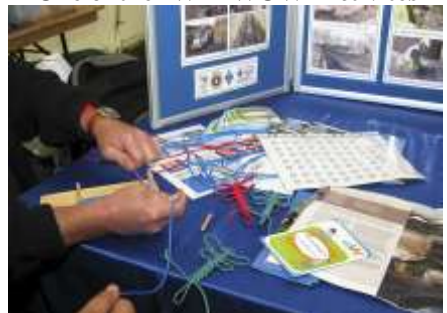
One of the IWA 'WOW' Activities

There are lots of photos, taken by Edwin Farrar, in the Photo Gallery on our website – www.neath-tennant-canals.org.uk