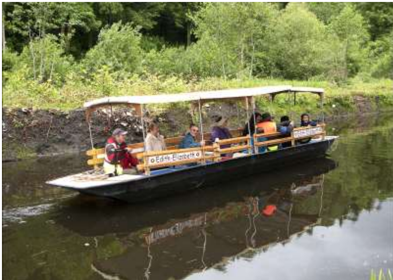
Below – the visiting Mon. and Brec. Trip Boat.

“Look what we found in someone’s garden!”