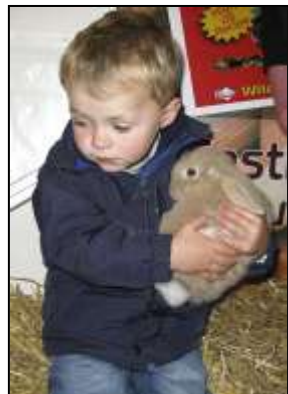
Hug a Bunny!