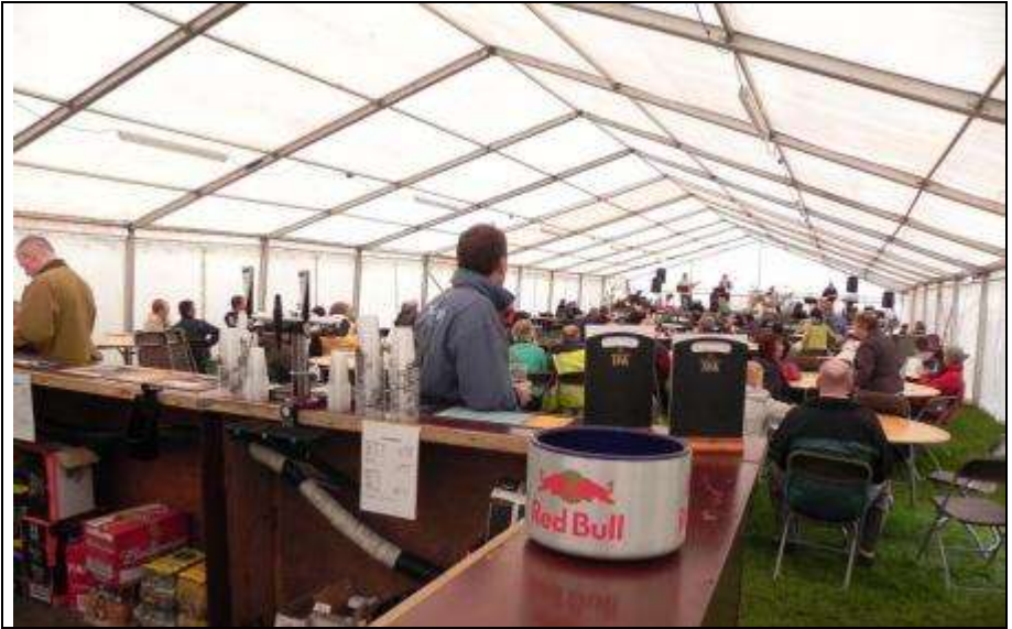
Inside the Entertainment Marquee.