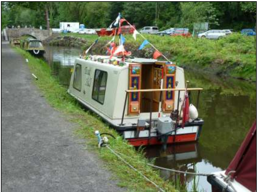
More boats – upstream of the bridge.