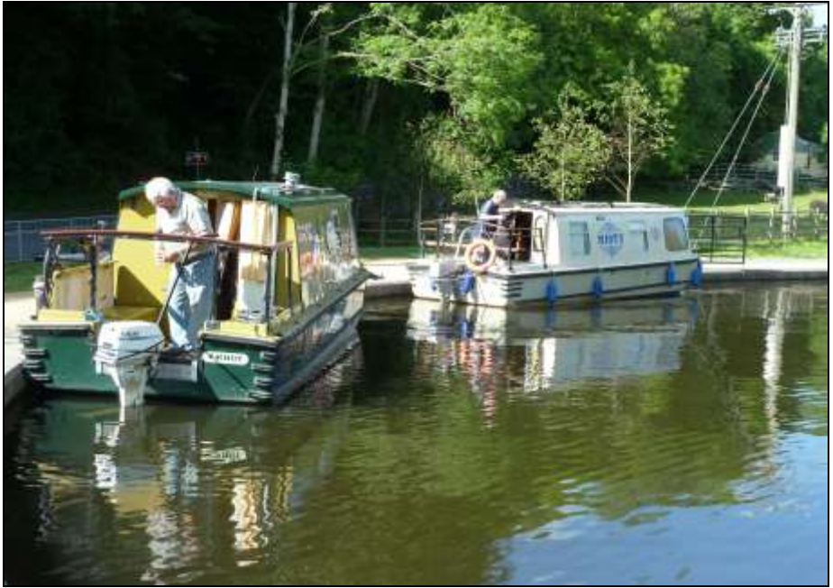
Boats arrive at the Ynysbwlllog Slipway on the Friday Evening – the sun shone on the Friday!