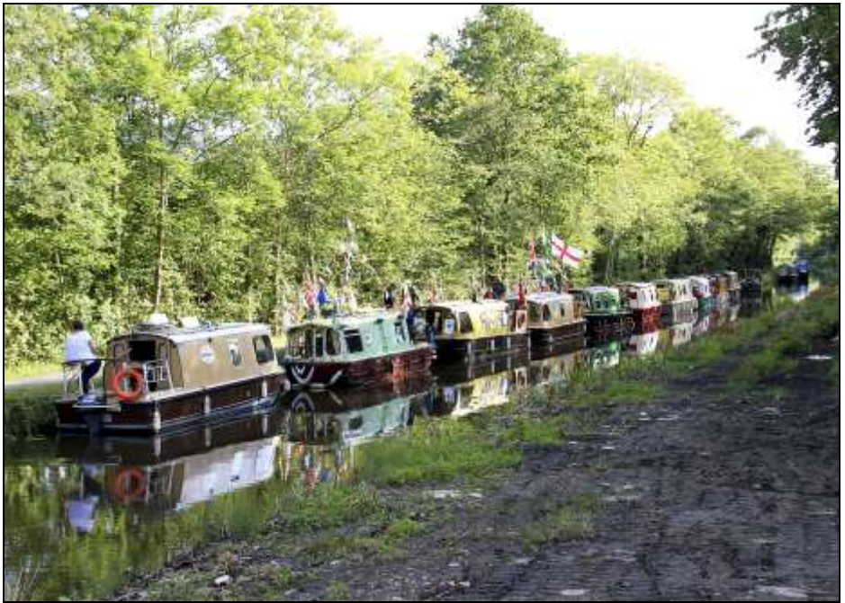
Boats at Festival Site.