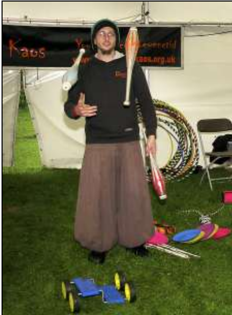
Organised Kaos Circus Group.

There were lots of activities arranged to keep the visitors entertained - model car racing, model aeroplane displays, sheepdog displays, a circus display by Organised Kaos and a tractor display by Neath Old Tractor and Commercial Club. In the entertainment marquee music was supplied throughout the weekend by Vintage Wine and The Whitefern Mountain String Band. On the Saturday night boaters, Trust members, stall holders and guests were entertained by Tonna Male Voice Choir