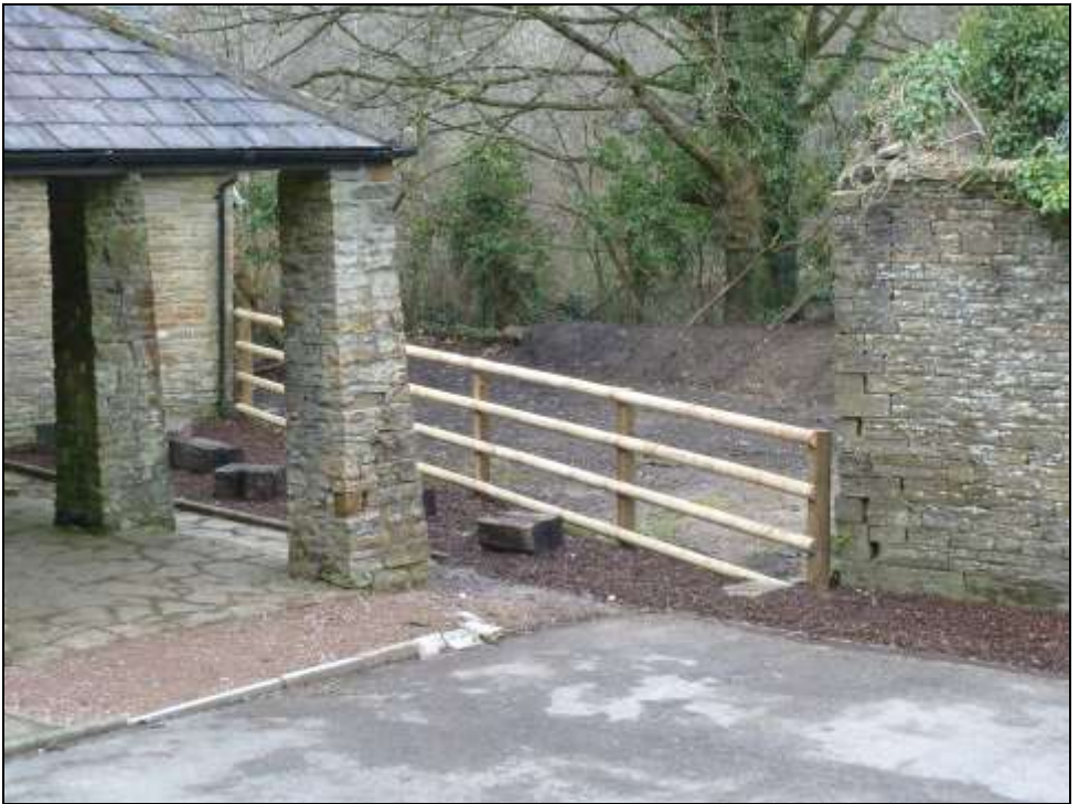
View of the area which has been cleared and fenced off at the side of the Workshops.

A number of work parties have been held at Tonna Workshops since the last Newsletter. The garden area has been cleared and rubbish burned. Part of the Long Shed collapsed and members cleared and stacked the fallen bricks for use in the future. Contractors were brought in to rebuild the gate pillars and hang new gates, repair part of the fence on the towpath boundary and to clear the area at the side of the Workshops, near the river. A new wooden fence has been erected here to prevent access to the river bank.