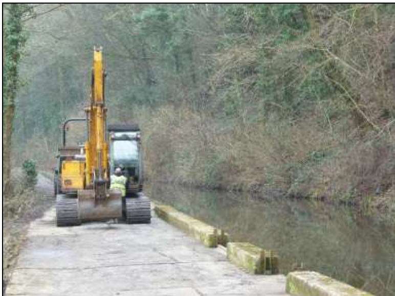
Heavy plant near the landslide on the Neath Canal.