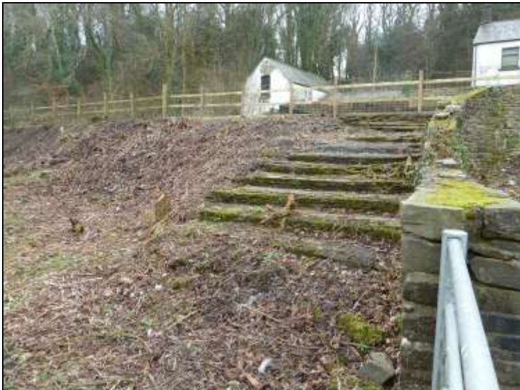
The steps and cleared ground in the garden area of the Workshops.