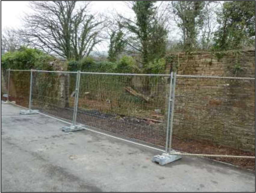
The Long Shed at Tonna Workshops. This is where the wall collapsed. When funding becomes available, the Long Shed will be rebuilt.