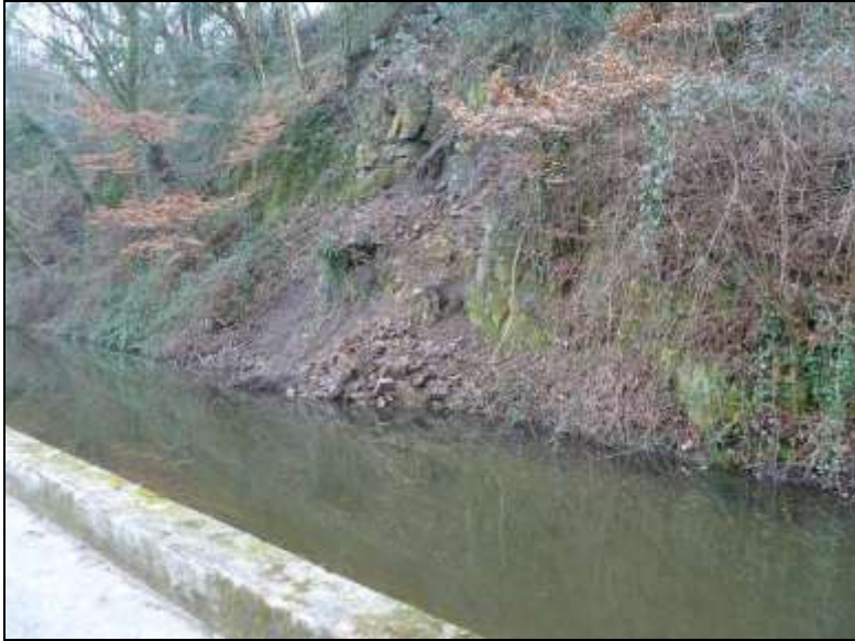
The landslide on the Neath Canal near Calor Gas. There is quite a large rock under the water in the centre of the canal which will have to be removed before boats can pass.